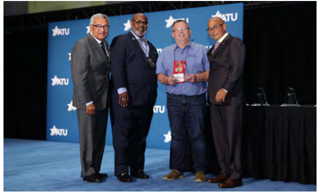
Local 1336-Bridgeport, CT