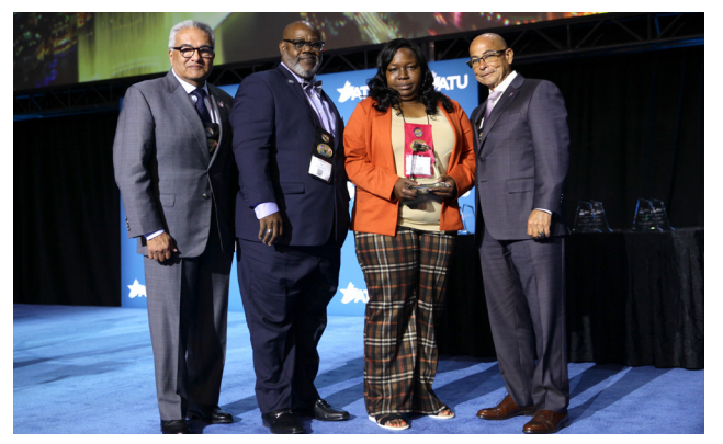
Local 689-Washington, DC

So in addition to striking the employers, Local 689 organized 11 units in the last Convention period. The local embarked on an incredible student transportation organizing concentration effort in Charles County, Maryland.