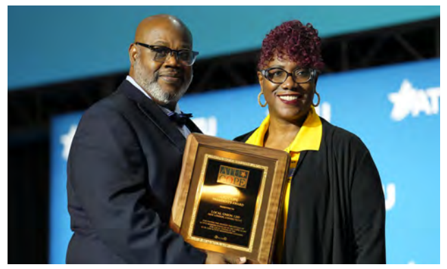
Local 1209-New London, CT