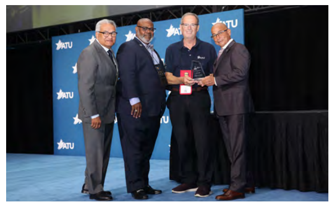
Local 569-Edmonton, AB

And the final recipient for this Maurer Award is Local 569, Edmonton, Alberta. (Applause.)