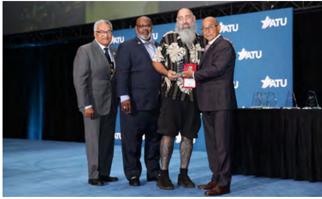
Local 1743-Pittsburgh, PA

Next up, organizing six units, is Local 1743 from Pittsburgh, Pennsylvania. (Applause.)