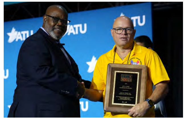
Local 726-Staten Island, NY