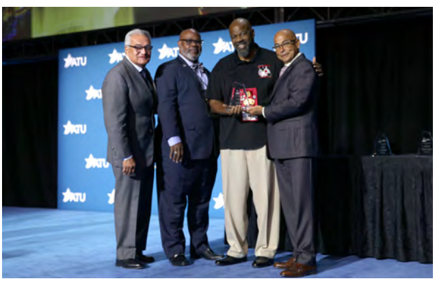
Local 1756-Arcadia, CA

After winning massive gains for their members at CoronaNorco, and Alvord yard, the local quickly pivoted into a new organizing campaign, bringing in 215 school bus workers from Riverside, California. They were out at the property every single day, and we had to get this petition in real quick because the school year was ending and they called me in three days and had a majority of cards and were ready for the election.