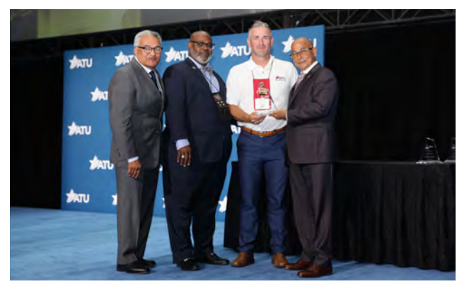
Local 987-Lethbridge, AB

and this win springboarded us into getting two more than wins at this company and starting something in Alberta that had not been done in quite a while.