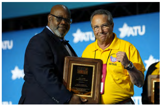
Local 618-Providence, RI