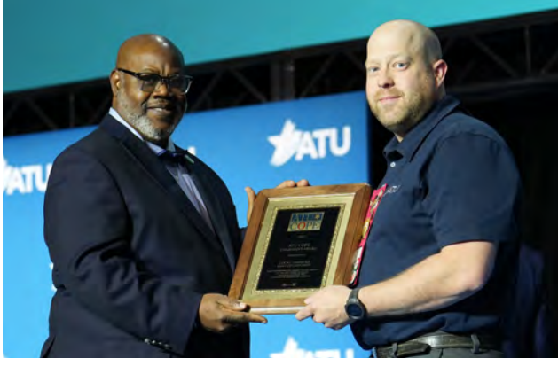
Local 1310-Eau Claire, WI